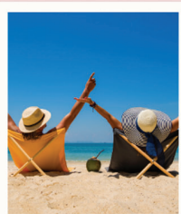
Mom's Day Out