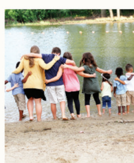
Katelyn's Fund Annual Picnic